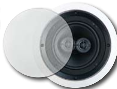
Stereo speaker front view