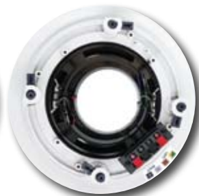
Stereo speaker rear view

Comprehensive 56-page installation and operating instructions