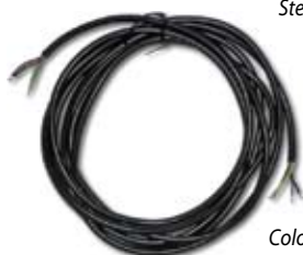
Colour coded 4-core cable